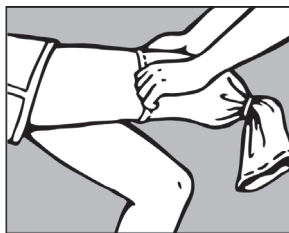
1. Apply the first layer.